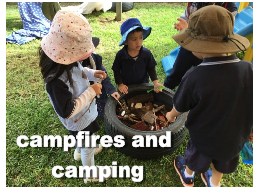
campfires and camping