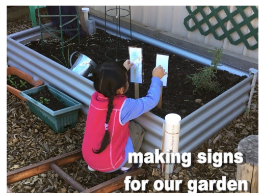
making signs for our garden

We acknowledge that our school is on Kurna country. We recognise and respect the Kurna people as the continuing custodians of the Adelaide Plains and pay our respect to Elders past and present.